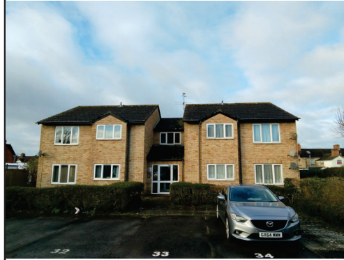
Roofing (Tiles and Cladding)