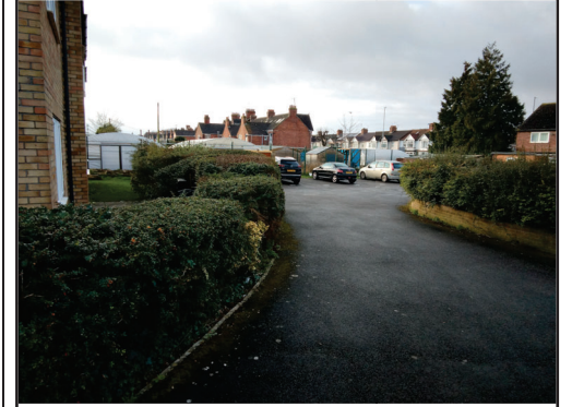
Communal Grounds (Gardens and Common Areas)