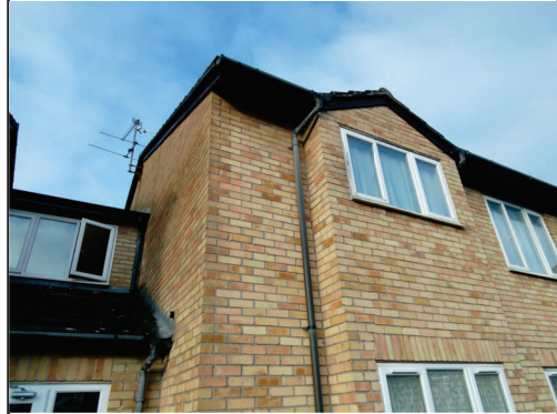
Guttering (Gutters and Fascia)