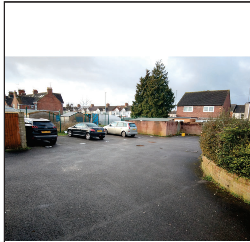
Car Park (Vehicle Parking)