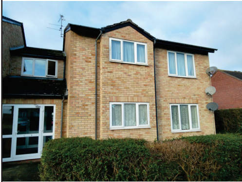
Exterior Structure (The Building)